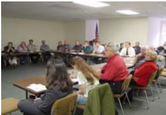
Participants of the E&S Roundtable Discussion

The Alliance's Monitoring Committee sponsored an Erosion and Sedimentation Roundtable Discussion November 21, 2002, at the Sawnee Center in Cumming GA. Invited participants included officials from city and county governments in the upper Etowah watershed involved in reviewing erosion prevention plans and enforcing regulations to reduce the amount of sediment entering our streams. Participants had lots of great ideas on how E&S programs could be improved to help protect water quality in our basin. The recommendations that came out of this meeting will be sent to city and local elected officials with suggestions on how local E&S programs could be improved! The group felt the meeting was so useful that they indicated they want to meet on a regular basis!