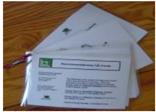
Macroinvertebrate ID Cards