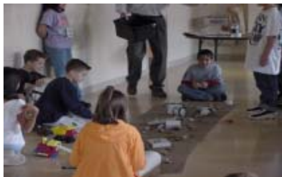
Students in Forsyth county learning how a river gets polluted.